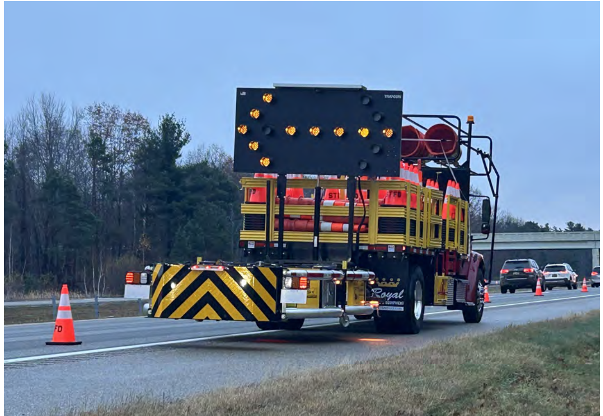
2120 TMA on its maiden response on I-196 blocking 1 lane of traffic.

The TMA's ability to respond to incidents quickly and efficiently since its deployment in late November 2024 is impressive. With 24 responses by April 26, it's clear that this apparatus is already making a positive impact on safety for our team and other first responders.